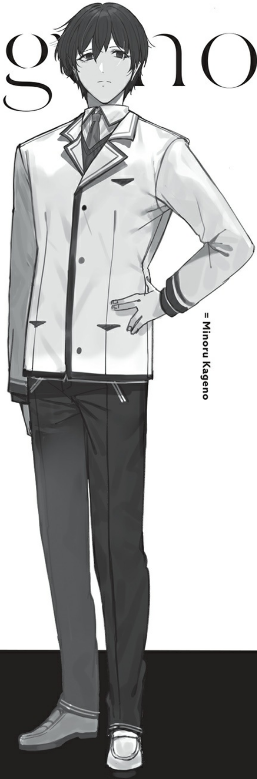
= Minoru Kageno

Cid's past self. He did his best to play the role of an unremarkable high school student by keeping his grades just below average. He devoted most of his free time to training but ended up having so few opportunities to use his skills that he resorted to spending his nights hunting down hoodlums and gangs. He always made sure to keep a crowbar in his backpack wherever he went.